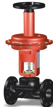
Pneumatic Act. Op. Flanged End Weir Tip Diaphragm Valve