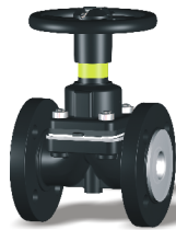
Flanged End Weir Type Diaphragm Valve