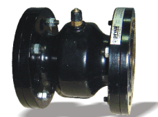
Flanged End Pinch Valve

In order to ensure 100% tightness, pipe line presure must be min. \Delta p 1,5 bar lower than air supply pressure.